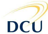
Dublin City University