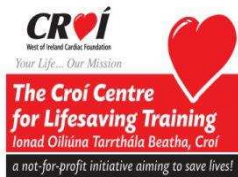
CROI The West of Ireland Cardiac Foundation