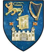
Trinity College Dublin