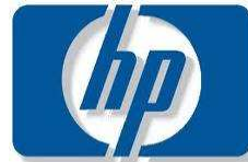
Hewlett-Packard Dublin & Galway